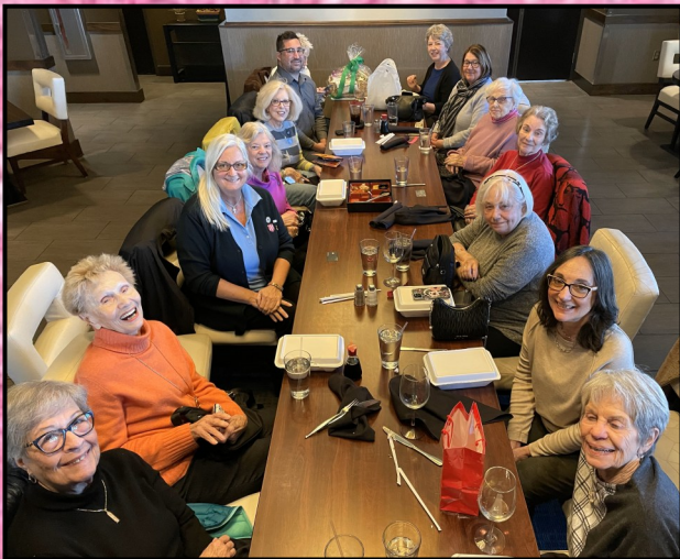
Leaguers Who Lunch group at Tea Tree Asian Bistro on April 8.