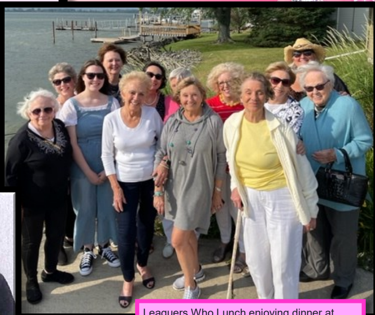
Leaguers Who Lunch enjoying dinner at Webber's Waterfront Restaurant